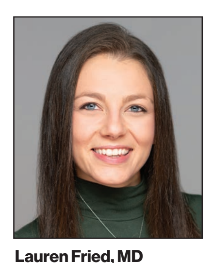
Hometown: Washington Crossing, Pennsylvania Medical School: NYU Grossman School of Medicine Areas of Interest: Dermoscopy, Pigmented Lesions,