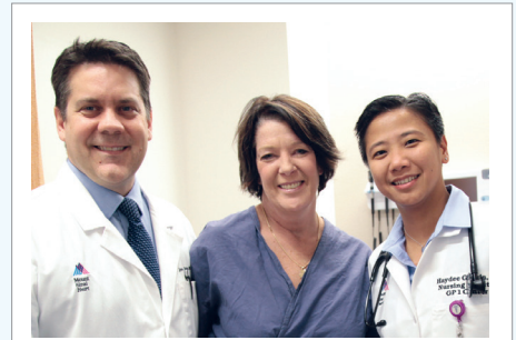
The Lauder Family Cardiovascular Ambulatory Center cares for 300 cardiac and vascular outpatients each day.

Plus, the center's 22 exam rooms and 5 vascular ultrasound rooms have an onsite anticoagulation clinic,