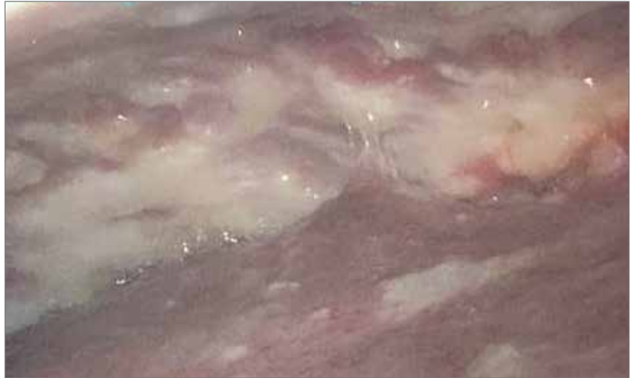
Laparoscopic procedure identifies white nodules/plaque as peritoneal disease

Before HIPEC is administered, surgeons remove all the visible tumors they can within the peritoneal cavity. This is followed by an internal "bath" of heated chemotherapeutic solution to destroy any remaining