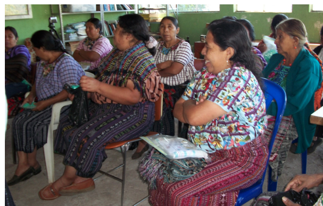
Mount Sinai residents train birth attendants in Guatemala to perform prenatal exams with basic assessments of maternal health.

The Department of Obstetrics, Gynecology and Reproductive Science