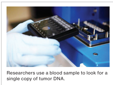
Researchers use a blood sample to look for a single copy of tumor DNA.