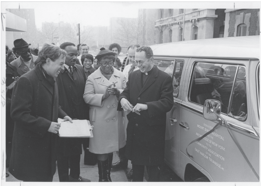
In 1970, Mount Sinai and the Archdiocese donated a van to the Community Association of East Harlem Triangle. The Mount Sinai Hospital buildings on the right stand where the Guggenheim Pavilion is located today.

Some say we can learn more from the failures of public health than its successes. As groundbreaking as the concept of community medicine was at the time, today you would be hard pressed to find a stand-alone “Department of Community Medicine” at most medical schools in the US. Rather, the field is more commonly merged with other medical disciplines, or its ideas dispersed throughout public health training programs. There are a variety of reasons community medicine did not take off — at least in name alone — but it is more important to focus on its success. Chief among these is that today, more and more frequently we as students hear the principles of community medicine in our classroom and practice experiences. We are prompted to see individuals’ health in the context of their community and involve communities in identifying health priorities. For some, these calls to action are heard so often that they may no longer seem so ground breaking.