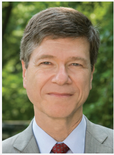
Dr. Jeffrey Sachs

On February 6, the Graduate Program in Public Health hosted its inaugural Grand Rounds. We had the pleasure of hearing from Jeffrey Sachs, PhD, the Director of the Center for Sustainable Development at