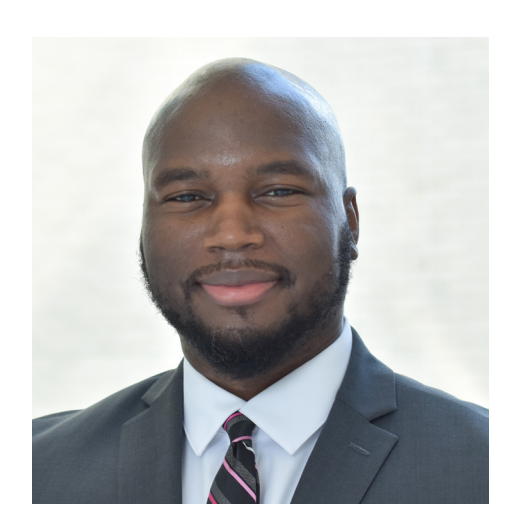
"During our sessions we will have guest speakers who provide professional insights on specific topics so that our residents are able to further their knowledge on living a healthier lifestyle."