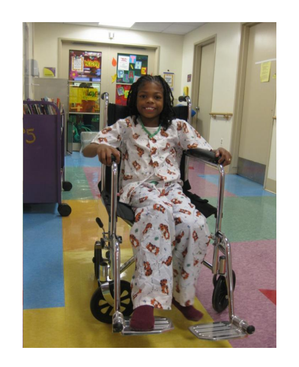
First, I will ride to the MRI in a bed or chair with wheels. Someone I know will be with me.