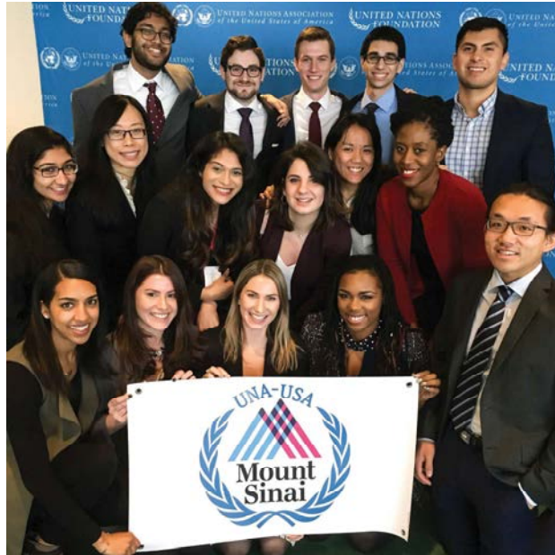
Photo: Icahn School of Medicine at Mount Sinai students at UNA-USA Member's Day 2017.

For example, since 1990, the number of childhood deaths per year has been cut in half. In this time period, vaccines, which are the greatest achievement of biomedical science and public health, were responsible for the lowest gap recorded in childhood